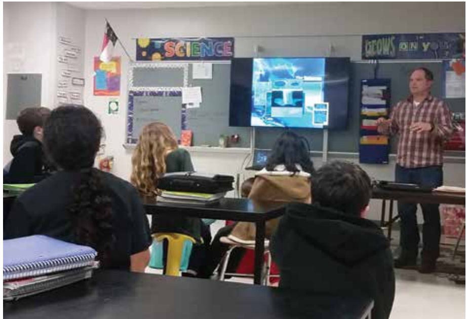
FIGURE 4: Students make predictions on mosquitofish evolution.

or zoo, and ask questions of the scientists or researchers who are presenting at these events. Scientists often have an interest in education but do not always know how to get involved. A simple conversation at the annual science festival near you could lead to an amazing collaboration opportunity. ●