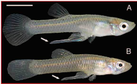
Fig. 3. Representative laboratory-reared G. affinis males derived from predator-free (A) and predator (B) populations. Arrows indicate the gonopodia. Note the larger gonopodium in A. (Bar, 5 mm.)

Thus, larger gonopodia of males in predator-free populations seem to reflect, at least in part, the influence of female mate choice on the evolution of male genital size.